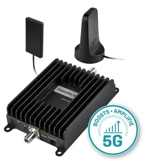
Most advanced 5G in-vehicle signal booster for rural Canada